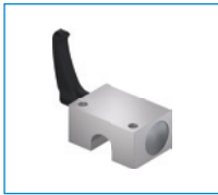
Series HKR Clamping element