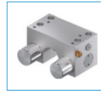
Series MKRS Clamping element