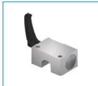
Series HKR Clamping element