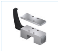
Series HK Clamping element