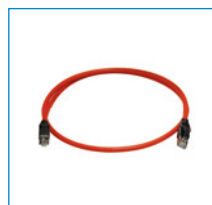
Adapter Frequency inverter