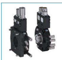
Robot change unit