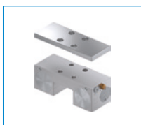
Series MK Clamping element