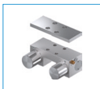
Series MKS Clamping element