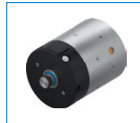
Series RBPS Clamping and braking element