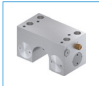
Series MKR Clamping element