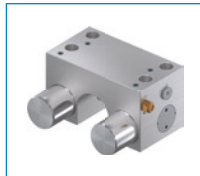
Series MKRS Clamping element