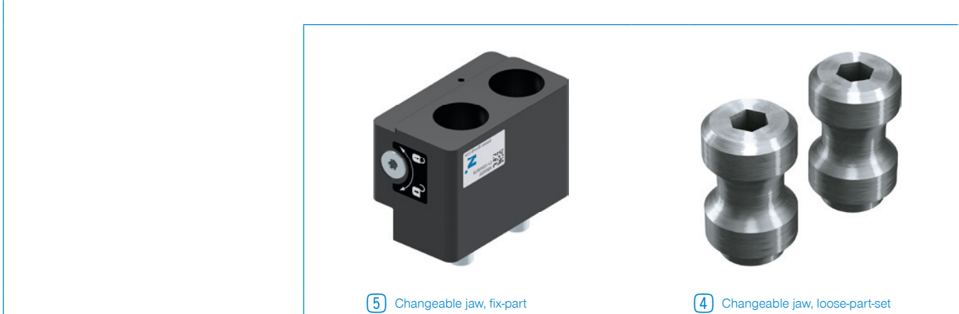
5 Changeable jaw, fix-part